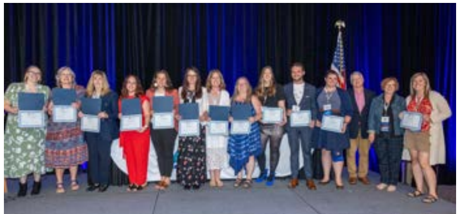
PHOTO FROM THE 2023 ASCLS ANNUAL MEETING